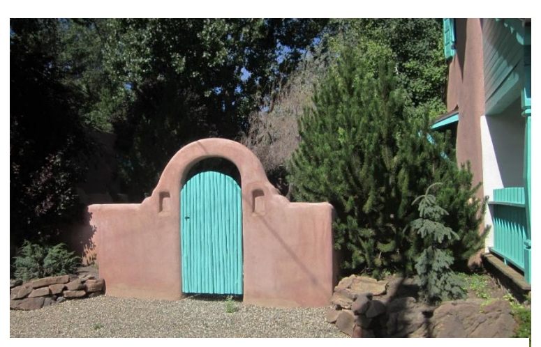
Turquoise gate with adobe wall, Taos

OK, so it's not really August, it's September. However, in August, we were spending some wonderful days and nights in New Mexico. Paid our dues by enduring the heat of Oklahoma and the Texas Panhandle both ways. In Santa Fe, we saw our old house on Mesa Verde Street (looked surprisingly the same after 30 years), went to the Santa Fe Opera (I envisioned Biafra being performed there not too many years from now), ate at some favorite restaurants (Tia Sophia's and Tomasita's), saw many old friends (writers, historians, journalists, and