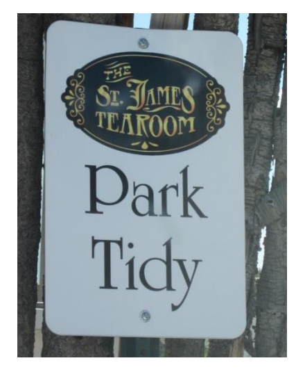
OK, it should be "tidily." Sign in Albuquerque.

members of our babysitting co-op – the babies now have babies), visited the now-closed campus of St. Catherine Indian School where I taught and did PR, had high tea with friends at the St. James Tearoom in Albuquerque (Jane Austen theme), and went to a conference in Taos (celebrating the 100<sup>th</sup> anniversary of the founding of the Taos Society of Artists) where I saw old friends who had helped me with research on my Taos book. Busy time! Lots of green and red chile, too, of course. Yum.